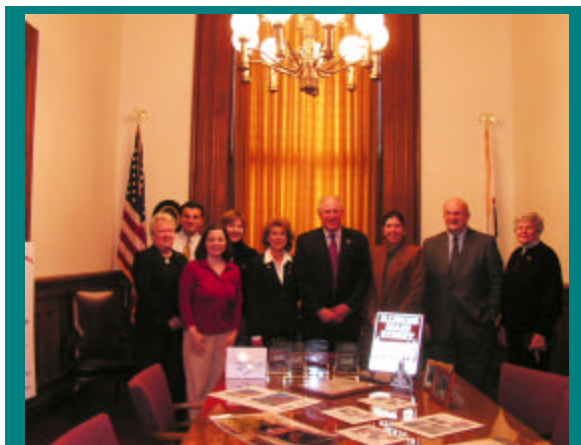
Lieutenant Governor Quinn and Senator Deanna Demuzio greet the Jacksonville delegation at the Press Announcement of their inclusion as a semifinalist.

On becoming one of Eleven Semifinalists for the 2006 Great American Main Street Award, Jacksonville has been selected from a nationwide pool of applicants, and will now move to the final round. A national jury comprised of professionals from the field of historic preservation, community revitalization, and economic development will further evaluate the semifinalists and select five winners. Winners will be recognized on June 5 th during the National Main Streets Conference in New Orleans.