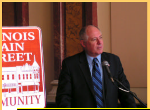
Lieutenant Governor's Opening Address

of Illinois Main Street programs illustrating excellence and growth in economic development.