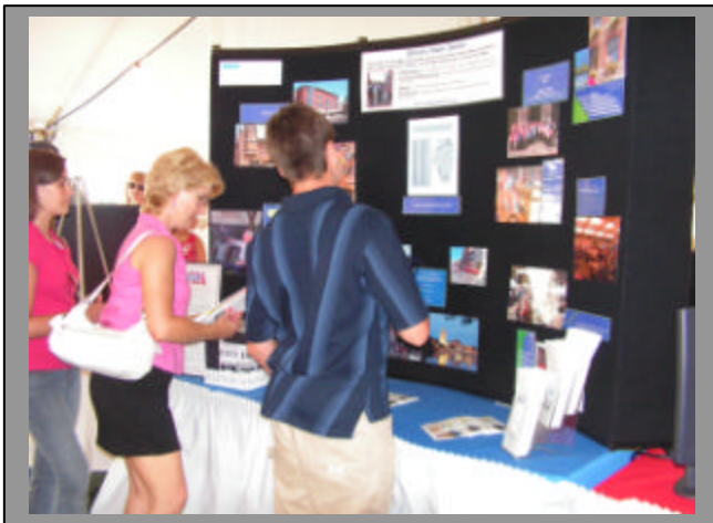
Illinois Main Street Display

We had over 3,000 visitors see our display and over 500 people entered the Great Illinois Main Street Giveaway drawing. There were 20 prizes awarded from Illinois Main Street towns.