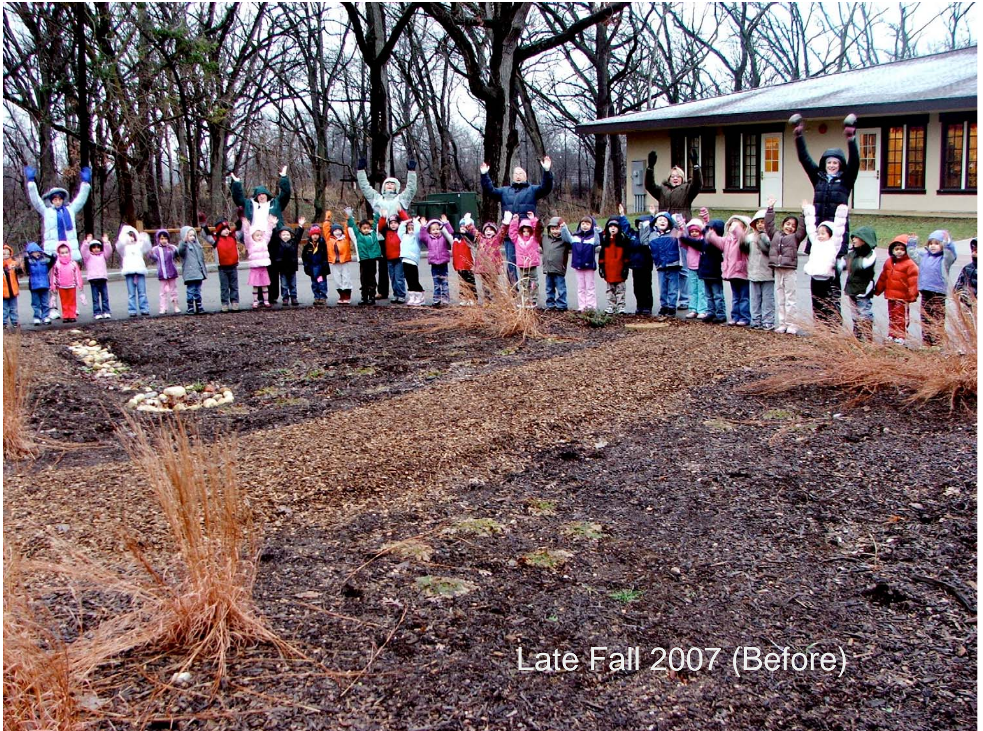
Late Fall 2007 (Before)